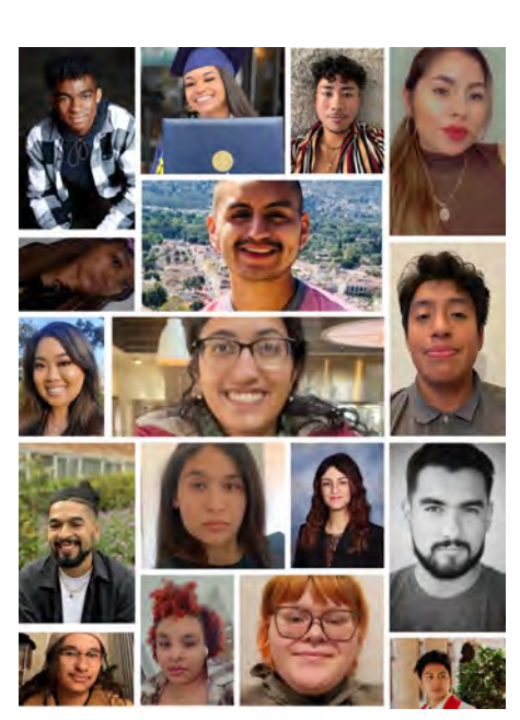
Campaign Youth Advisory Council