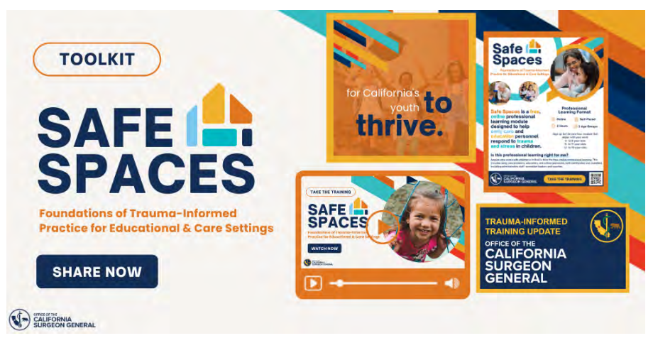
Partner Communications Toolkit includes a video, PowerPoint deck, flyer, social media and newsletter blurbs.